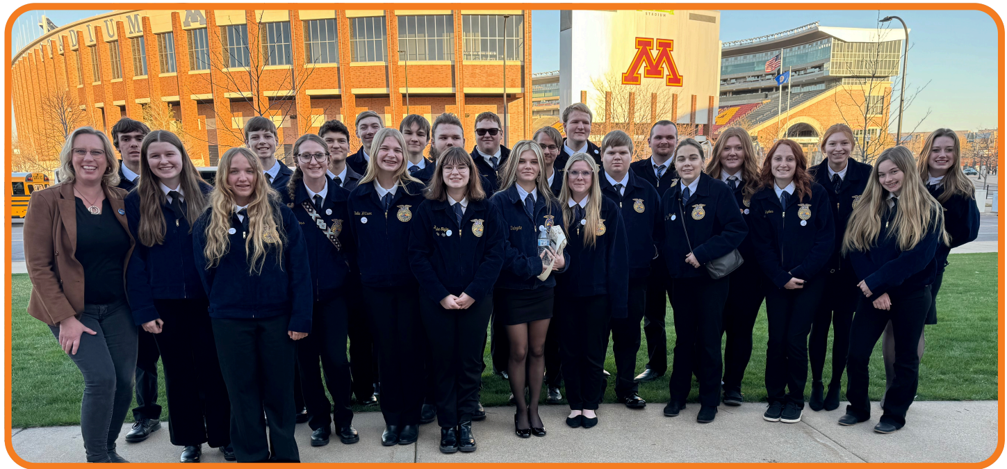
Princeton's FFA student organization, focused on agriculture and leadership, is a Gold Chapter, with state and national qualifiers!