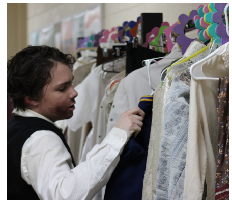
Sophomore Catch H. picks out outfit before going on stage.