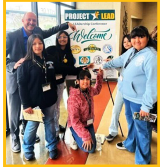
Nelson Elementary School students participated in the LEAD leadership conference on February 4, where they gained valuable insights into the functions of various city departments and their roles in supporting the community.

Read more about our Project LEAD students on our webpage .