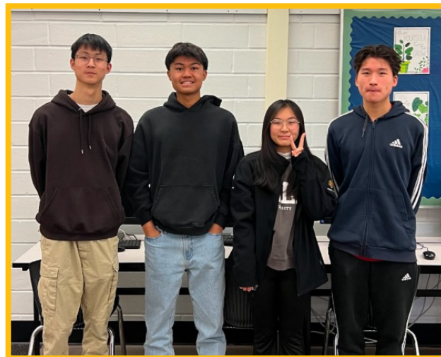
Glen A. Wilson High School computer science students recognized as a U.S. House of Representatives Congressional App Challenge winner by Linda Sánchez, California's 38th District Representative.

Read more about the FOCAL app on our recent news and announcements page .