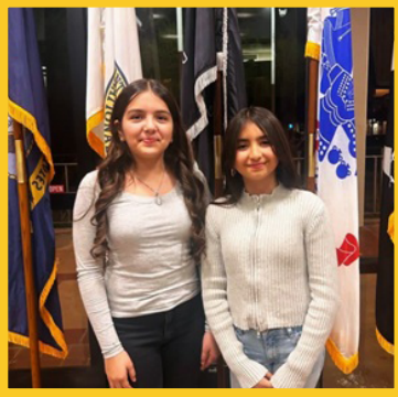
Workman Elementary School leadership students spoke at a February 11 La Puente City Council meeting as part of Project LEAD.

Hacienda La Puente Unified School District elementary school students are actively participating in the civic process through the Project Life Experiences About Democracy (LEAD) program, a dynamic, hands-on partnership with the City of La Puente that fosters civic learning and engagement.