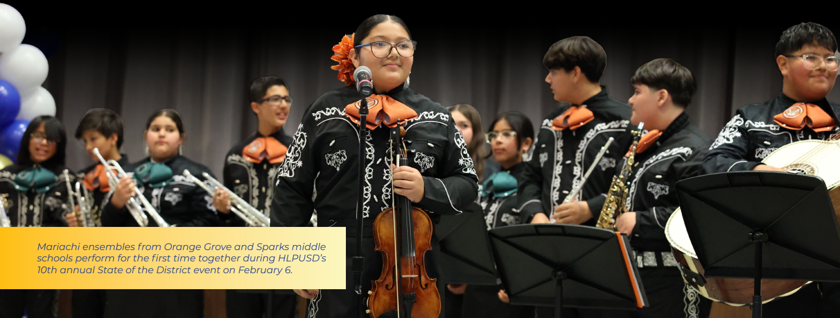
Mariachi ensembles from Orange Grove and Sparks middle schools perform for the first time together during HLPUSD's 10th annual State of the District event on February 6.

Check out a recap video of our student performers on our Instagram page .