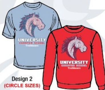
Design 2 (CIRCLE SIZES)