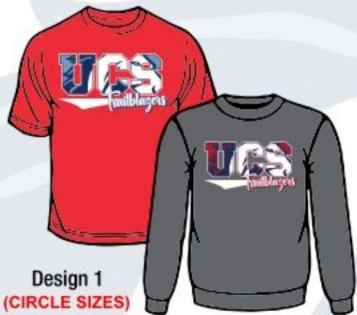
Design 1 (CIRCLE SIZES)