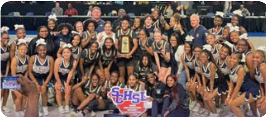
2025 BLYTHEWOOD HIGH SCHOOL GIRLS BASKETBALL STATE CHAMPIONS