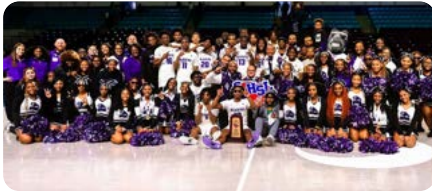
2025 RIDGE VIEW HIGH SCHOOL BOYS BASKETBALL STATE CHAMPIONS

This is the second year in a row Ridge View has won the state championship and the sixth time since 2018.