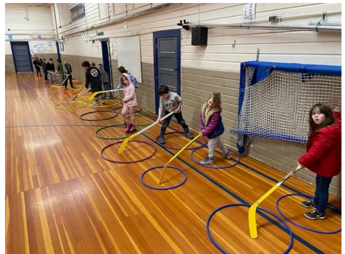
PE Fun, look at these future hockey stars!