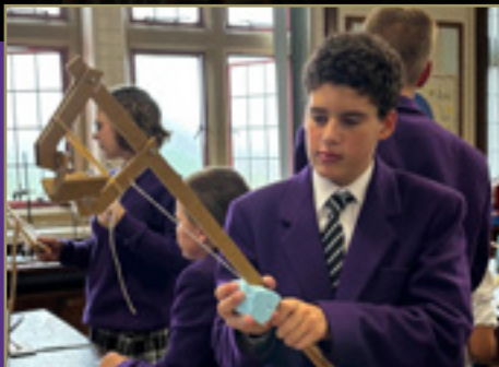
Year 9 STEM Challenge Page 6