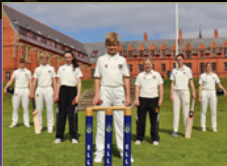
Ellesmere College in Cricket's Top 100 Page 12