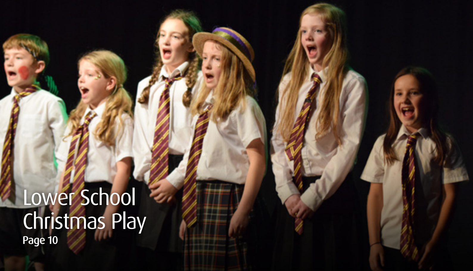
Lower School Christmas Play Page 10