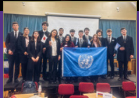
Students Shine at MUN Conferences Page 14