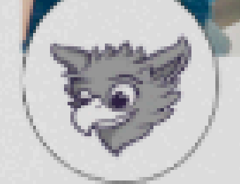
Morgan Kincaid Preparatory School