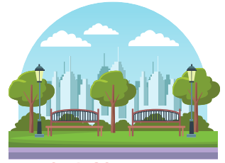
IN OUR COMMUNITY