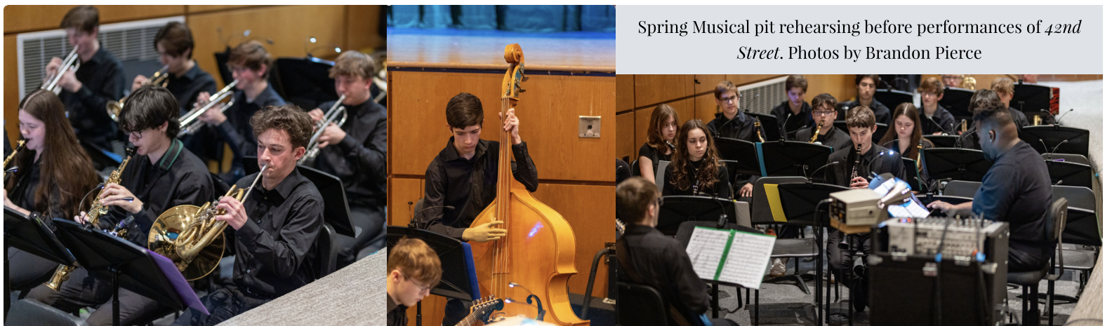
Spring Musical pit rehearsing before performances of 42nd Street.

“For me it would have to be decorating my future studio apartment in NYC with my future golden retriever lying on my couch with Fleetwood Mac playing on my vinyl player.”