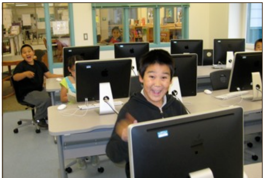
New Stuyahok students taking Accelerated Reader quizzes on their new computer lab in the library.

Students may also be using the AIMS web online progress-monitoring test. This is used more for K-8 students.