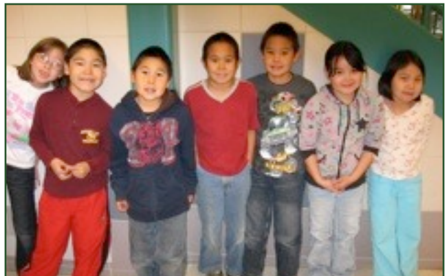
New Stuyahok students between classes.

The student count has been turned into the state for Southwest Region School District. Our official count for 2009-2010 school year is 644.05. This has not been certified yet, but this number will be very close to our final certified count. We had 633.5 for the 2008-2009 school year, so our enrollment is up about eleven students from last year.