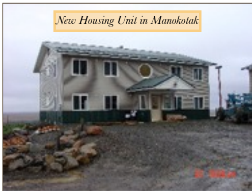
New Housing Unit in Manokotak

When this is completed we will no longer have to divert our waste stream to the BBHA Advantex system from the school as well as housing this will save us roughly $ 650 per month on sewer charges.