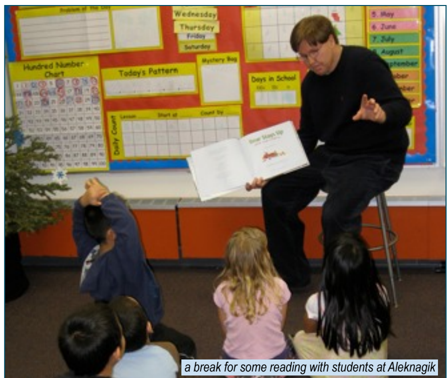
a break for some reading with students at Aleknagik

It is so wonderful to have such beautiful schools for our students. The new schools and new teacher housing has really helped raise the level of the education going on in our schools.