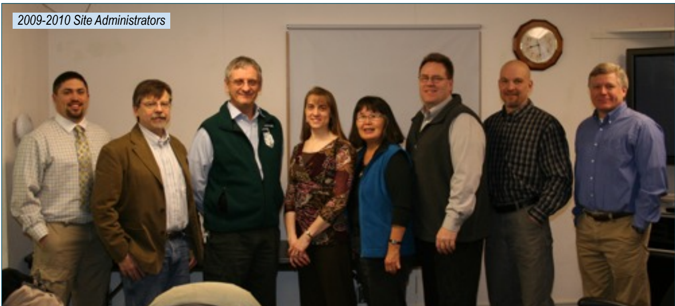
2009-2010 Site Administrators