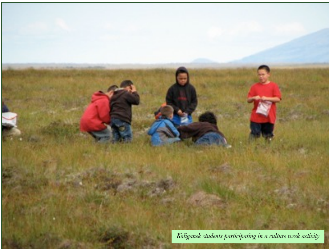
Koliganek students participating in a culture week activity

School sites have continued to complete their Reading is Fundamental (RIF) distributions. This program continues to provide books for students to select and take home at three times during the school year.