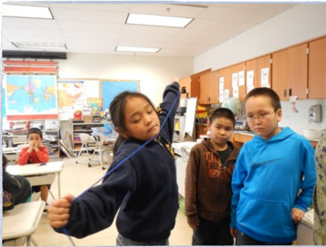
Third grade Yup'ik Studies class in Togiak.

SBA scores are used to determine Adequate Yearly Progress (AYP) based on participation and performance for schools and school districts statewide each year.