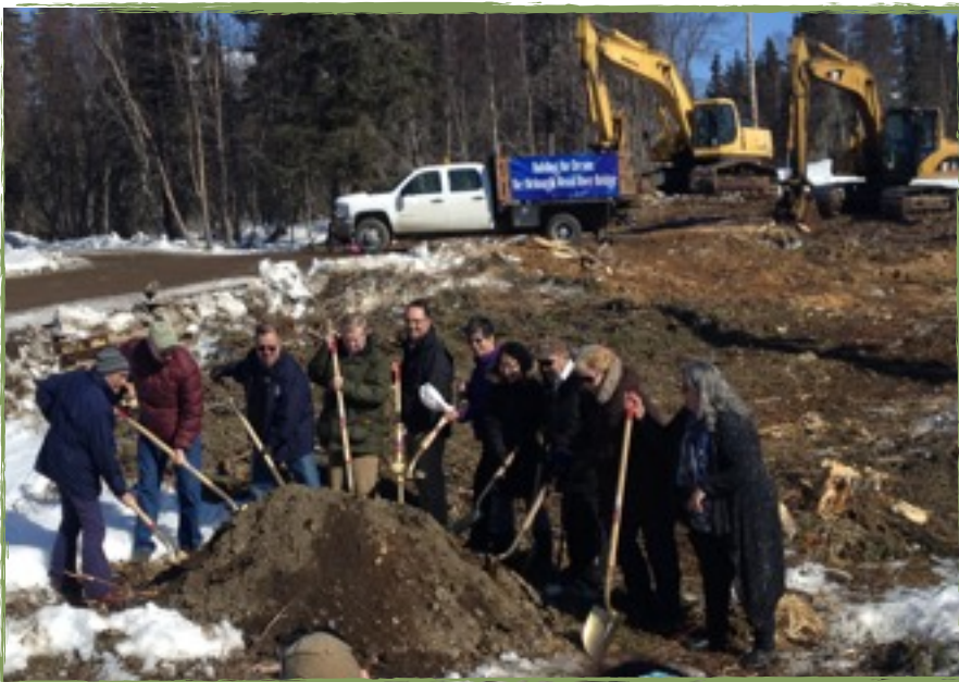
Aleknagik-Wood River Bridge groundbreaking ceremony

SBA testing is complete for another year. 3rd-8th grade students worked hard for an entire week to show what they have learned in the past school year. Every morning, the staff worked together to provide the students a hot breakfast of either pancakes or scrambled eggs. With this being the last year of the paper/pencil state exam, we are all very excited and anxious to see what next year's state testing has in store for us!