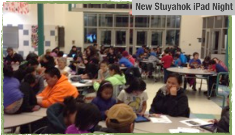
New Stuyahok iPad Night

amount of information during the semester and was asked exactly the same questions on the final exam as a student in New Stuyahok. Common pacing and the development of common assessments is an ongoing goal of the instructional department. Teachers have begun to see the value of these common assessments and the value they add to classroom instruction and are eagerly preparing the common assessments for second semester.