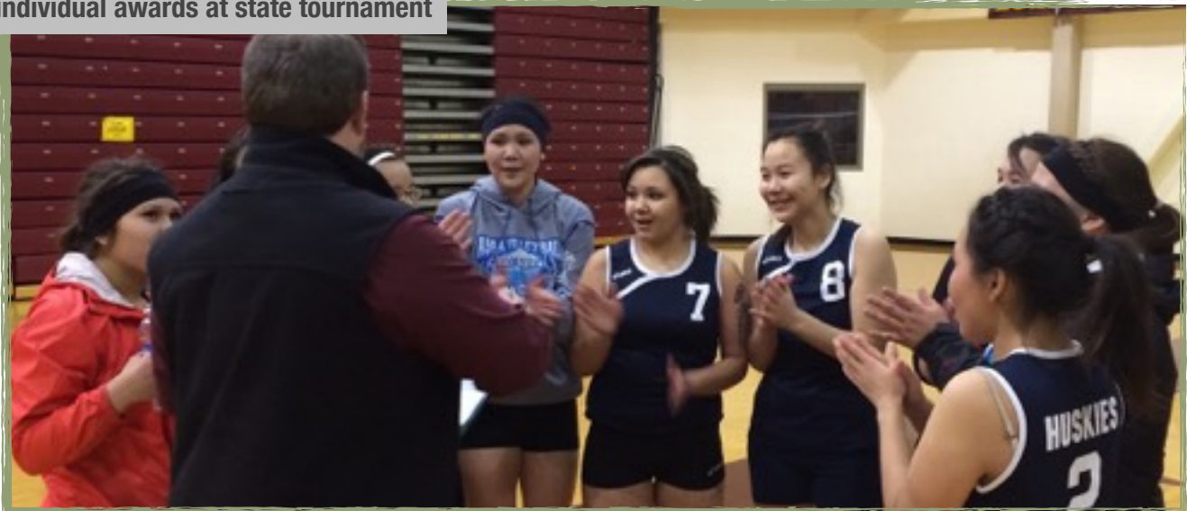
individual awards at state tournament

The afternoon concluded with sessions presented by AASB and ACSA staff to address the question “What Does the Data Say?” and to bring the data together to share with the legislature. The idea is to use data to paint a picture for the legislature of your school district and the students that are served.