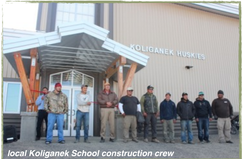
local Koliganek School construction crew