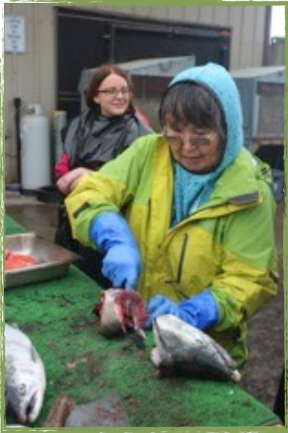
New teachers learn to prepare salmon at the new staff inservice.