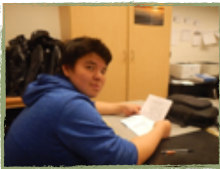
Yup'ik 101 Grammar