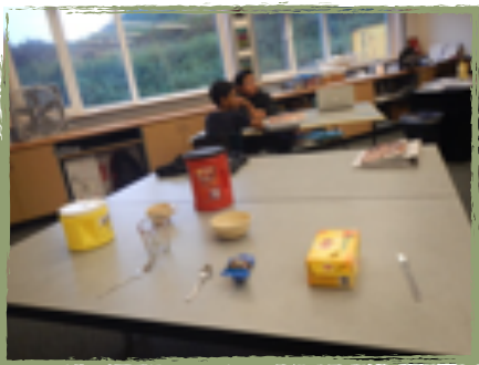
YOR - Setting the Stage