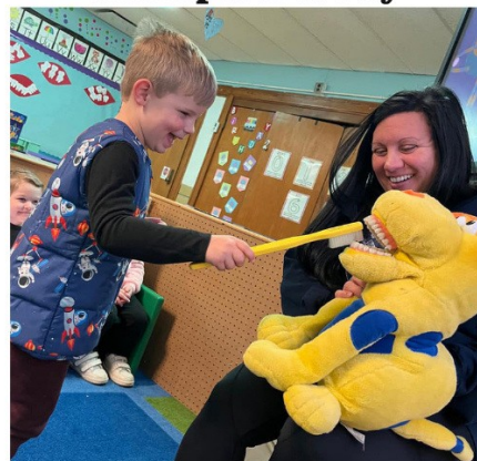
Learning to Brush