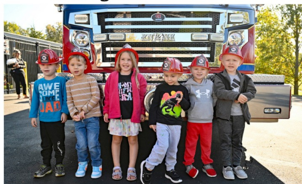
Fire Safety Day