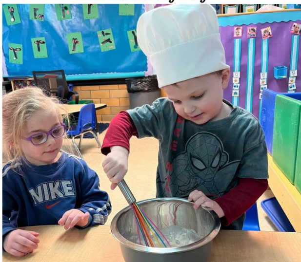
Making Muffins for the letter M