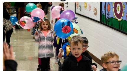
Let's have a Parade.