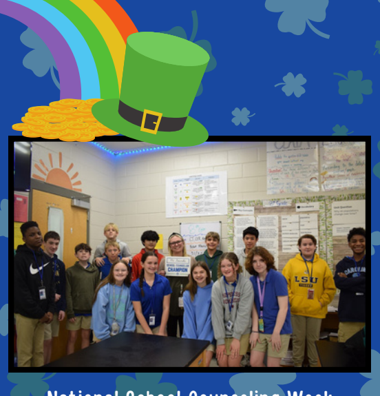
National School Counseling Week