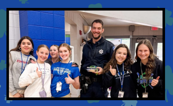
We appreciate our SRO!