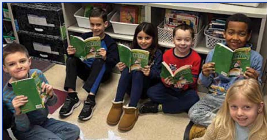
East Hanover students break out their books during a reading session.

Families are encouraged to participate and celebrate the power of reading as a community.