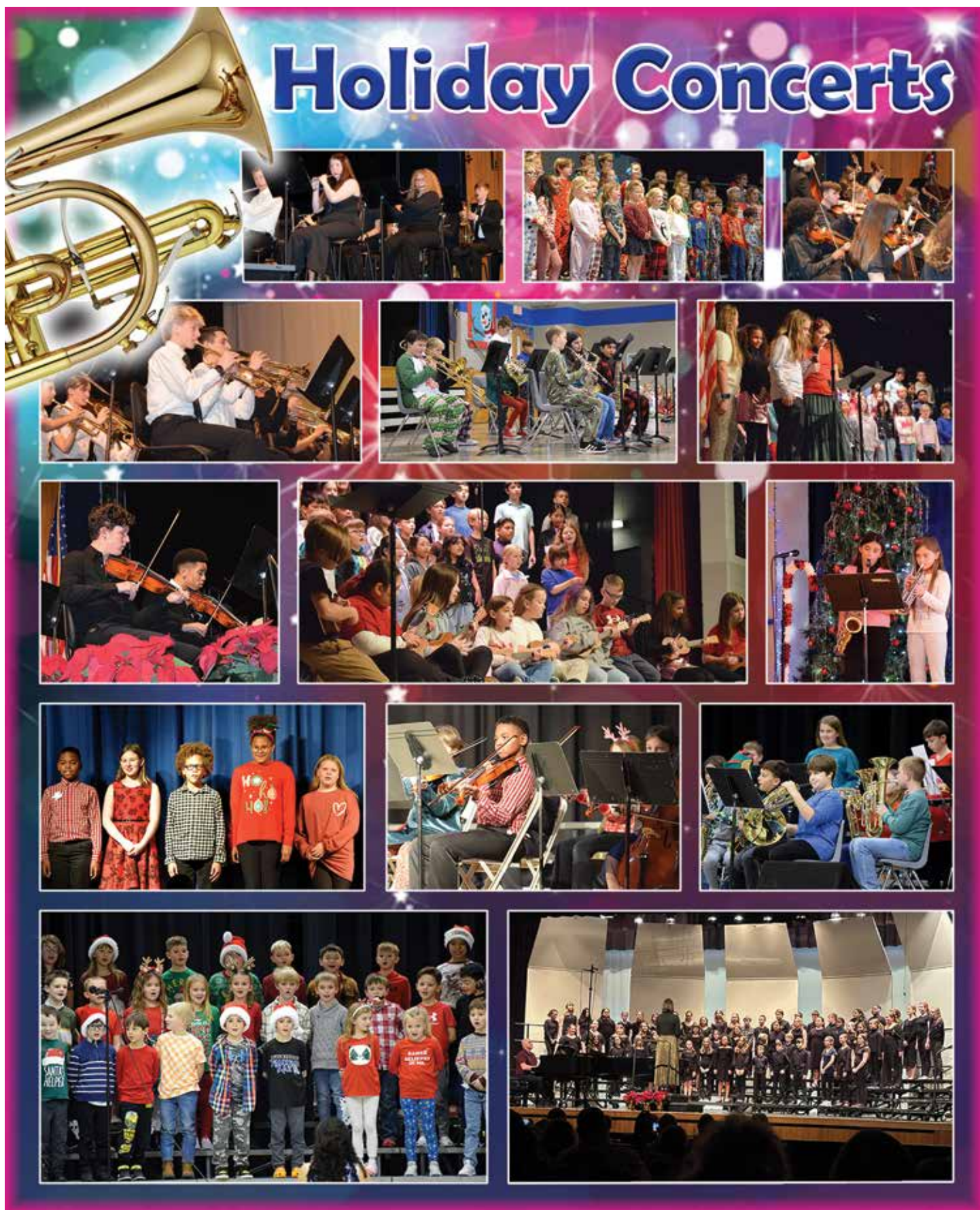
Lower Dauphin School District's holiday concert season brings out the smiles and cheers. Students across the district put their skills on display, culminating in concerts from elementary to high school.