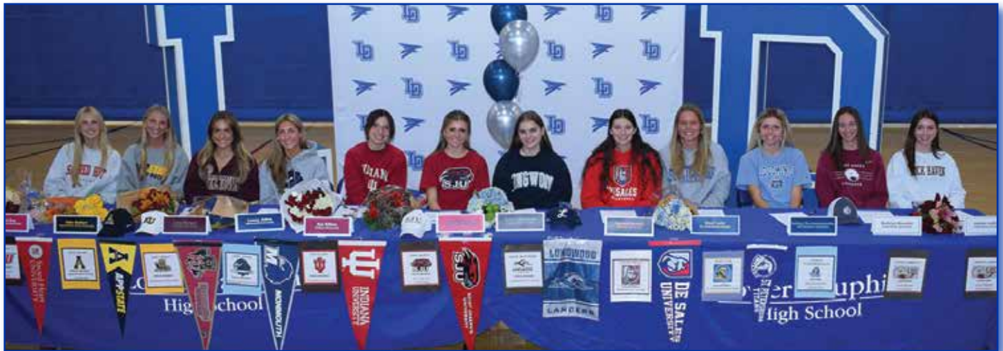
12 Lower Dauphin high school student-athletes enjoy a moment together after announcing their college decisions during signing day in November.

12 Lower Dauphin seniors student-athletes announced their college decisions and next steps during their signing day ceremony in the gym in November.