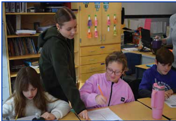
Conewago students working on different situations and lessons during Hour of Code.

on a box to get a treat. With different activities for the students to learn and adapt to, these real-world applications students were offered the chance to get a jump start and create interest for potential future coders.