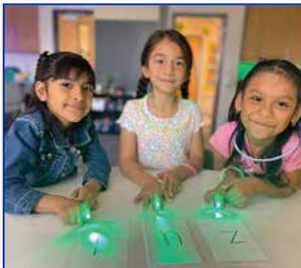
East Hanover students enjoy a reading activity.