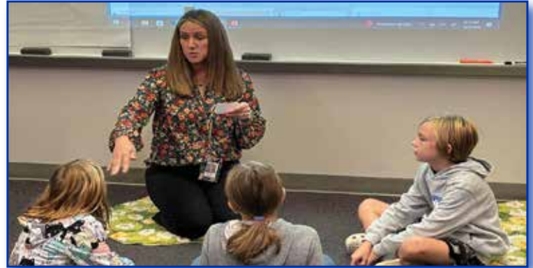
Lower Dauphin school district students enjoying reading and writing lesson.

With the pilot going well, the team is excited to recommend CKLA to be used in all K-5 classrooms for the 2025-2026 school year. This adoption supports our Structured Literacy Strategic Plan, ensuring that all students receive consistent, high-quality instruction. Lower Dauphin is committed to helping