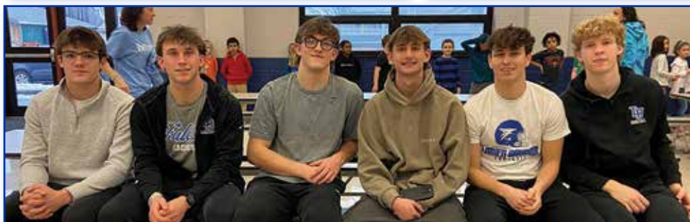
Lower Dauphin High school students visit NYE Elementary School to work with students on their PRIDE project and help them celebrate Falcon Pride.

dancing and movement fun as students let loose and enjoyed being active.