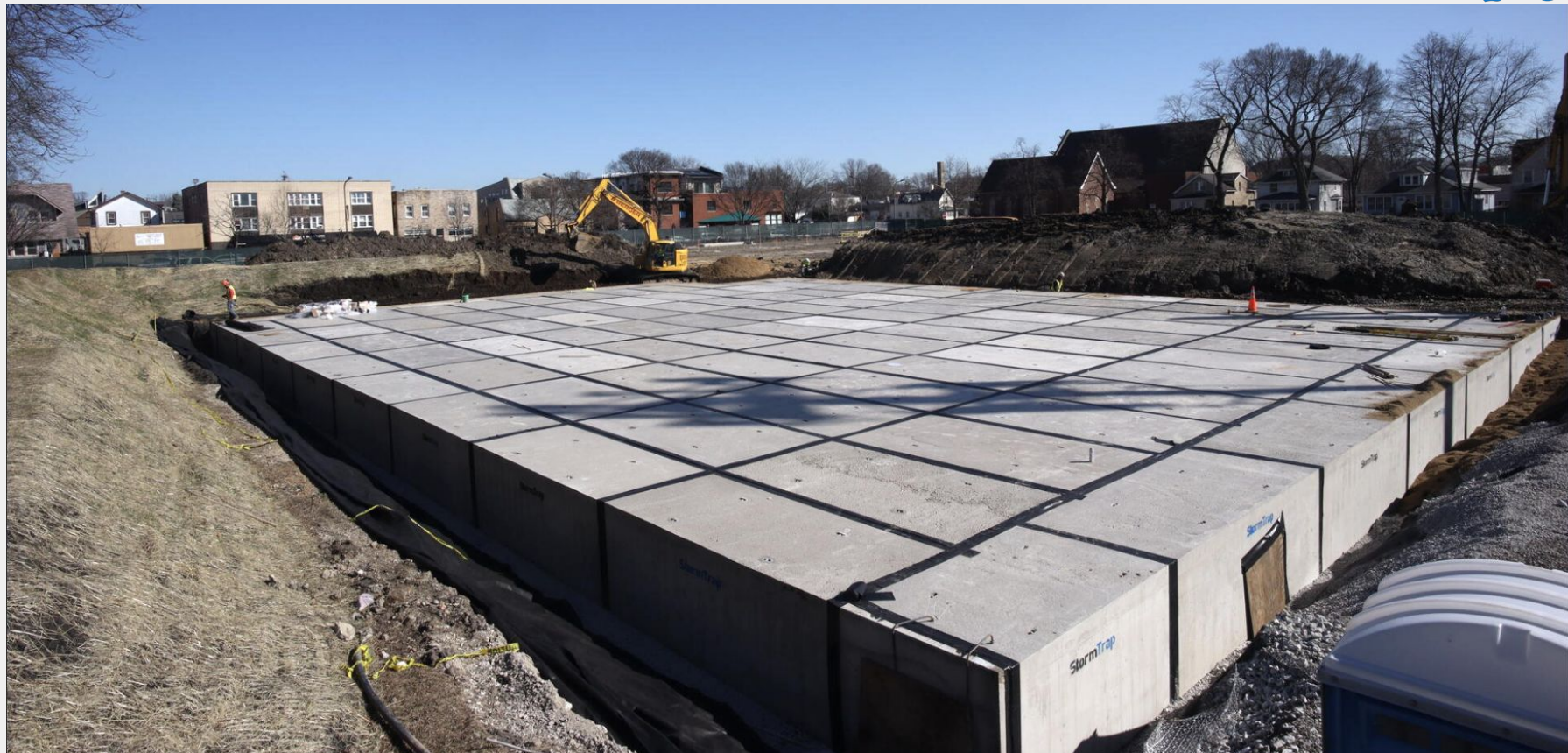
Stormtrap Basin Install