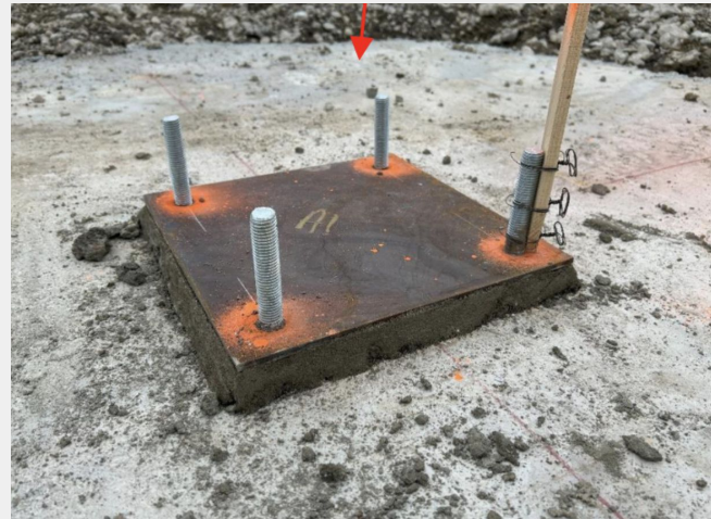
Column base plate with anchor bolts (B. Kogan, 3/25)