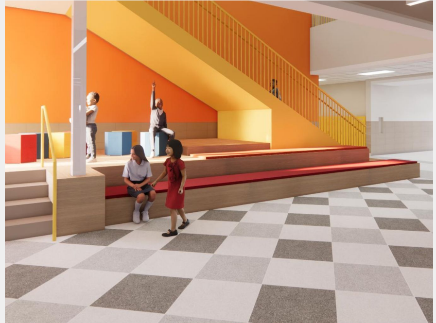
Learning Stairwell Rendering