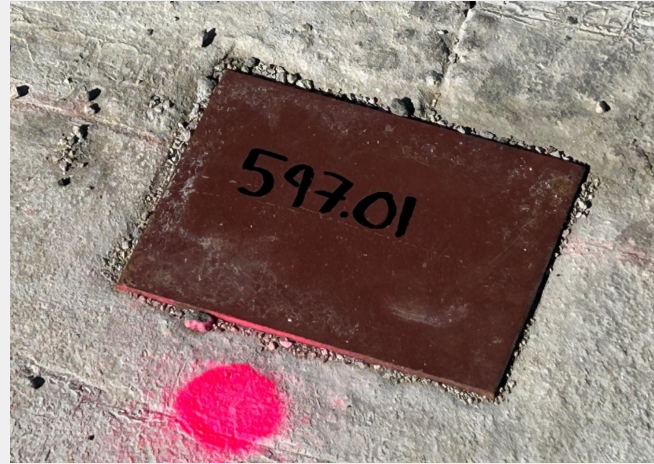
Embedded steel plate (B. Kogan, 2/25)