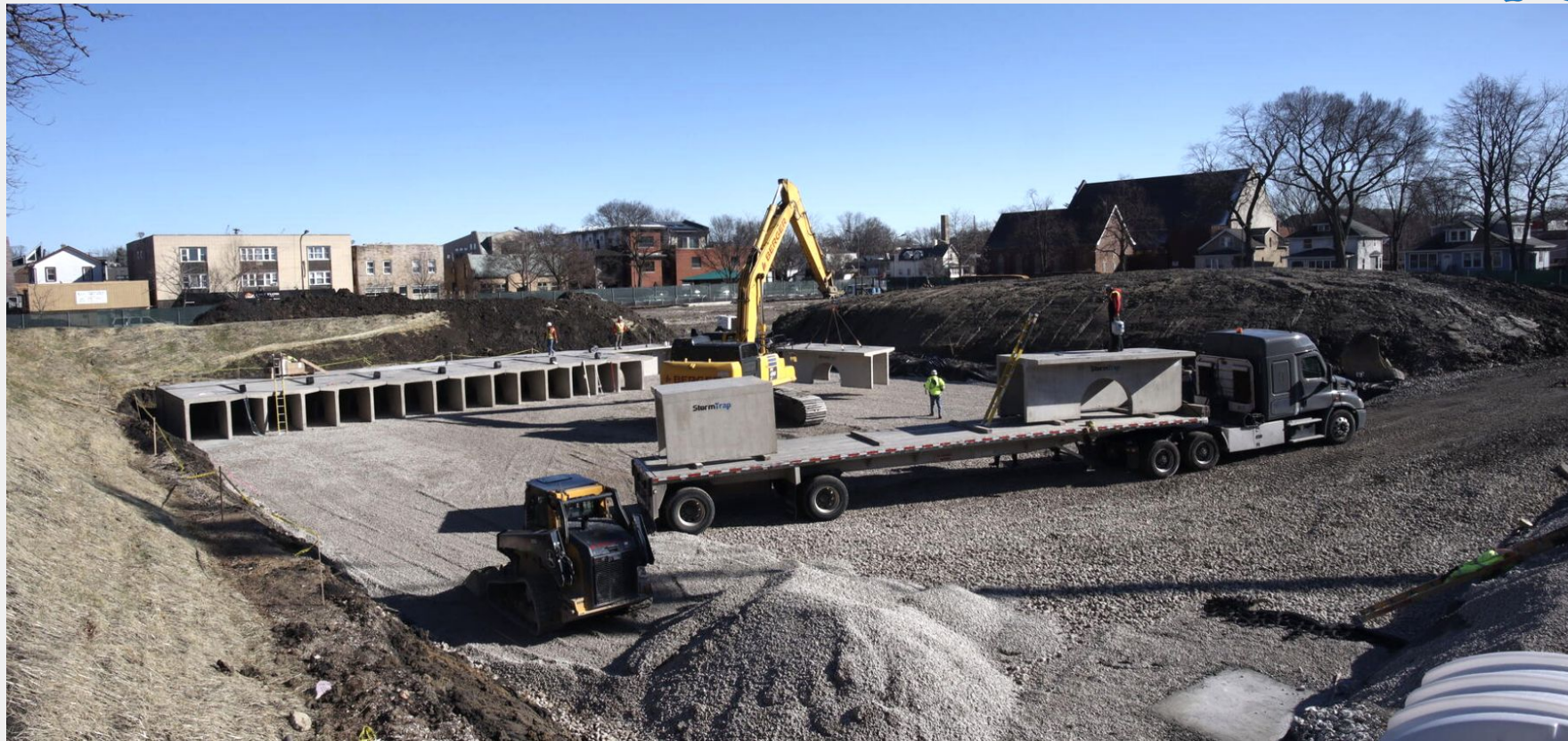
Stormtrap Basin Install