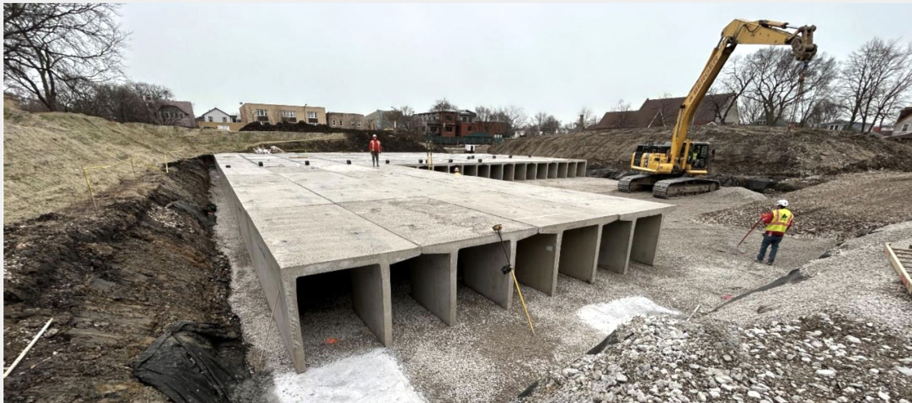
Stormtrap Basin Install