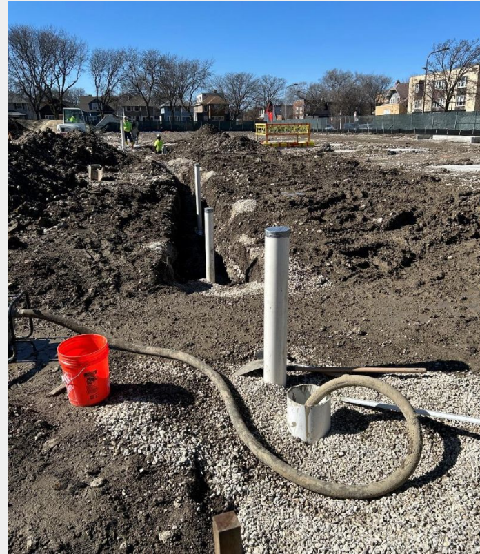
Underground piping for plumbing (B. Kogan, 2/25)