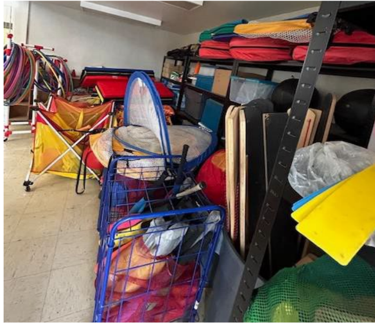
Room #14_Matt Room