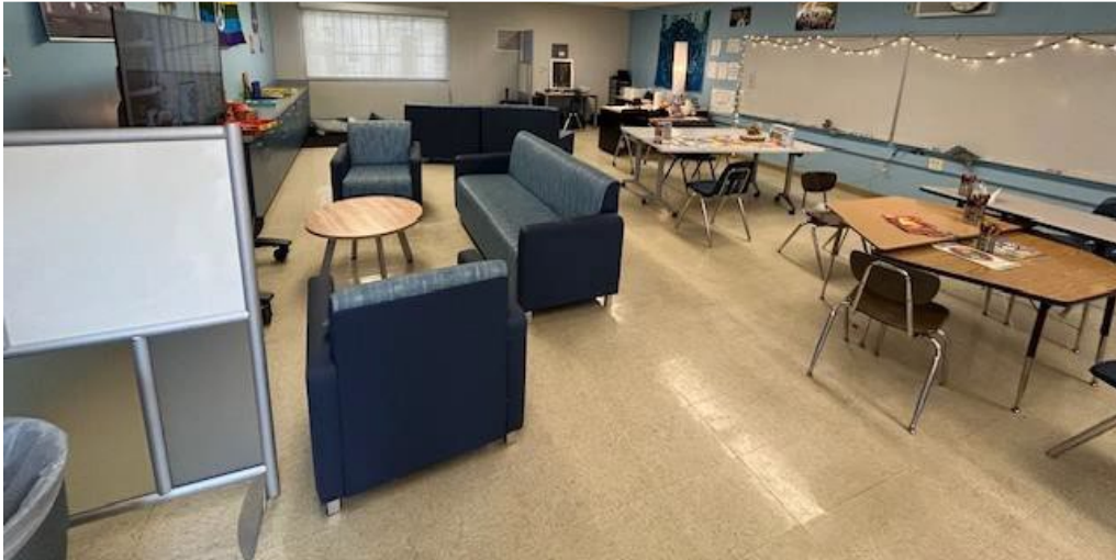
Room #26_Wellness Center

Response: Keep all lounge furniture and partitions and remove all teachers/student desks and chairs