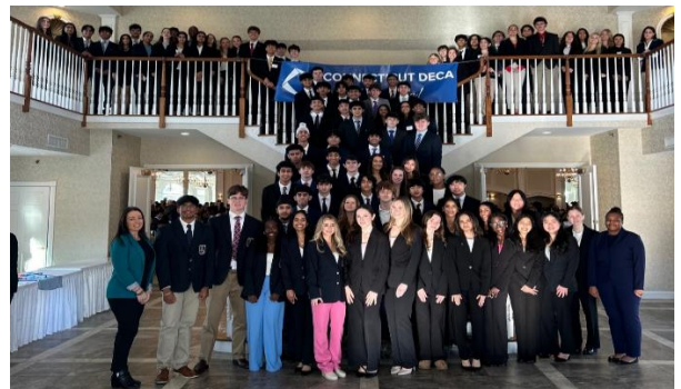
Photo: THS Students at the DECA State Competition '25