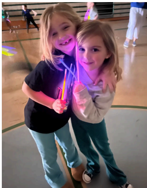
Students celebrate with Glow Party