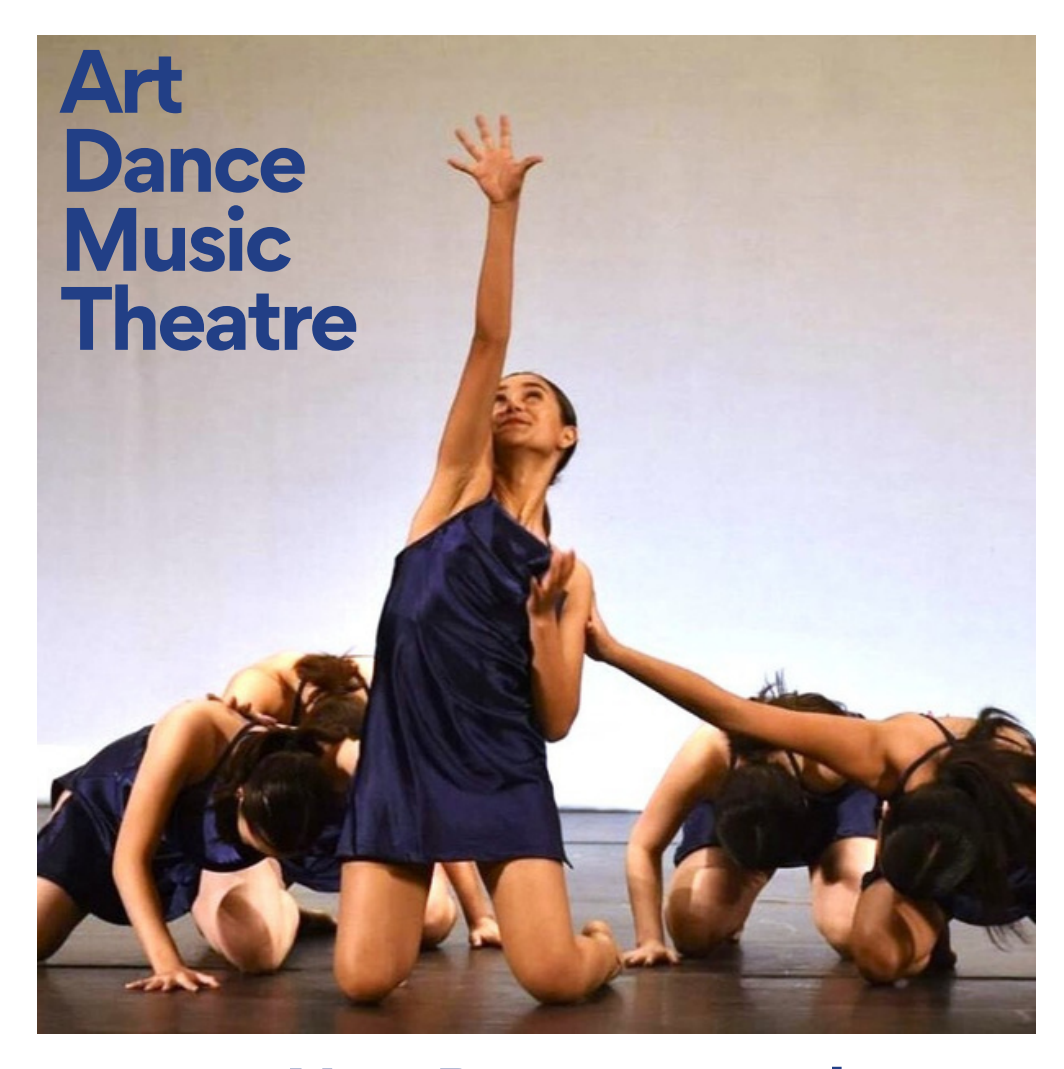
New Programs such as, Mariachi, Orchestra & Broadway Bound

By the 2026-2027 school year, HLPUSD will strengthen community engagement, promote a clear understanding of the district's arts education programs, and enhance access to arts education through comprehensive communication, data analysis, and professional development initiatives.