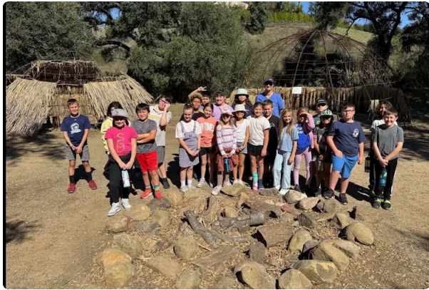
3rd Grade Field Trip to the Chumash Museum