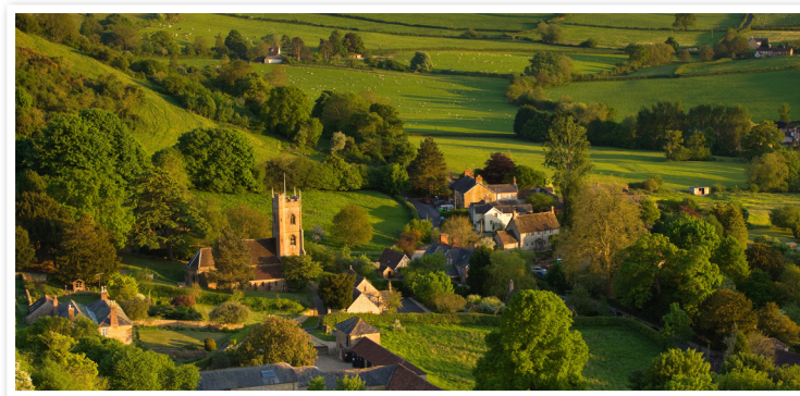
Village of Corton Denham in Somerset

The countryside is a rural area outside of a town or city. Less people live and work in the countryside than in a city.