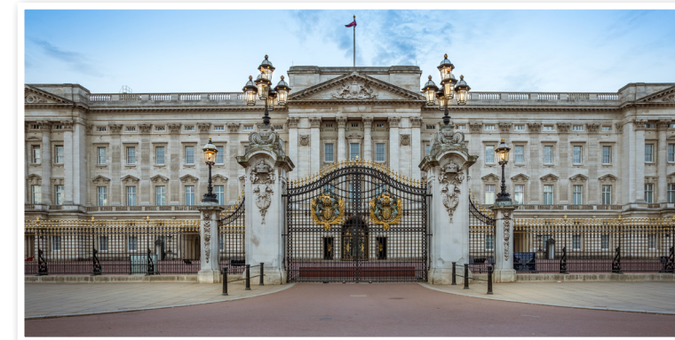
The Queen lives at Buckingham Palace.

Queen Elizabeth II is the current monarch of the United Kingdom. She was born in 1926 and became Queen in 1952. The Queen is famous across the world.