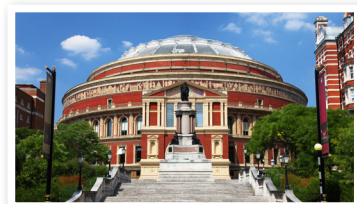
Royal Albert Hall