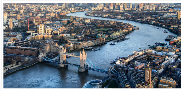
City of London

A city is a large urban settlement with lots of traffic and tall buildings. There are many shops and restaurants to visit there.