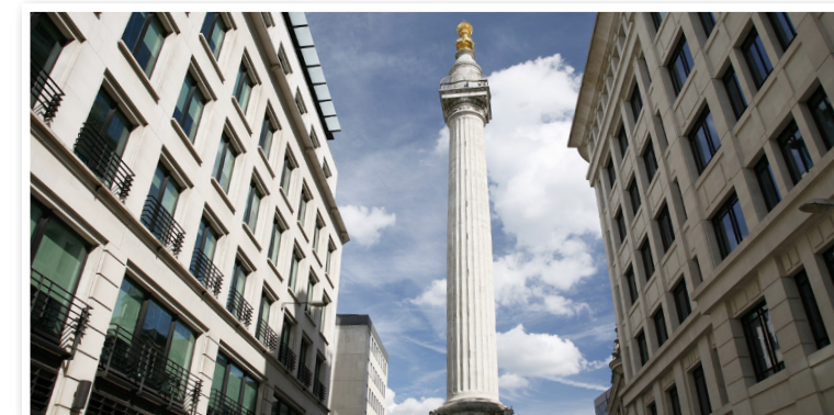
Monument to the Great Fire of London

The Great Fire of London was a significant event in London's history. It began in a bakery on Pudding Lane on Sunday 2nd September, 1666. Many buildings were destroyed including St Paul's cathedral. Today, a monument stands where the fire began.