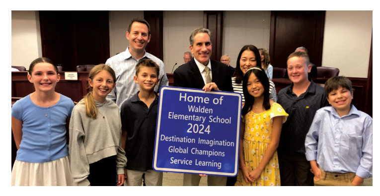
Above: The winning Destination Imagination team and their coaches were honored at a Village of Deerfield Board of Trustees meeting.

also received a DaVinci Award for their innovative presentation, which used weather-themed special effects to illustrate complex emotions as a character traveled through a fantasy setting. One judge praised the team, writing: "The