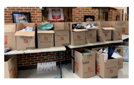
Boxes consume the front hallway of Wilmot Elementary during the sorting process.

have contributed gifts and volunteered their time over the years!