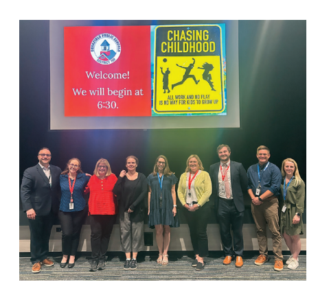
Above: District 109 principals and assistant principals attend the Chasing Childhood screening.

As we move into the spring, we plan to continue the conversation by hosting additional school-based events. We are also exploring programs such as the "Let Grow Project," which encourages tasks and projects that children can complete at home to boost their independence.