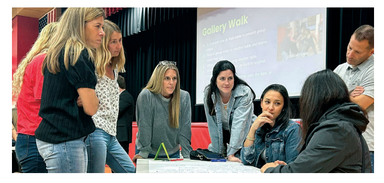
Above: Parents and district staff members came together for community discussion events this fall to brainstorm ways to foster independence in kids.

Between July and September, over 200 people attended evening discussion groups held at our schools. These gatherings provided families interested in the book and its themes an opportunity to come together and discuss ways to instill confidence in their children while reducing their dependence on technology.