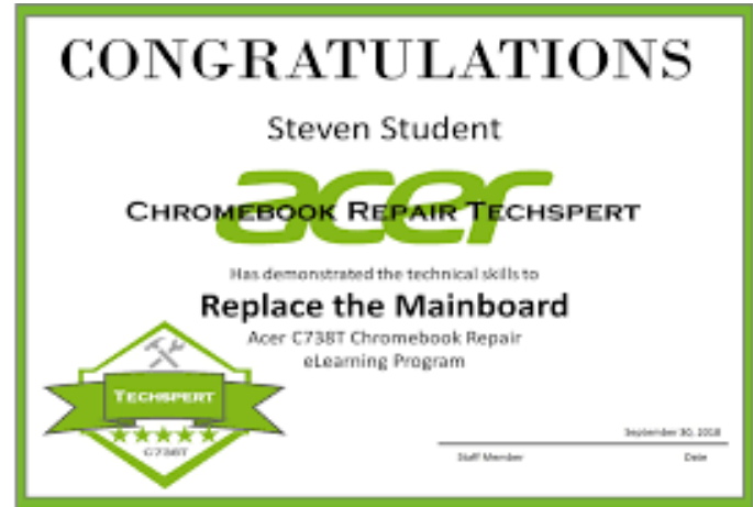
Credited Work-Based Learning