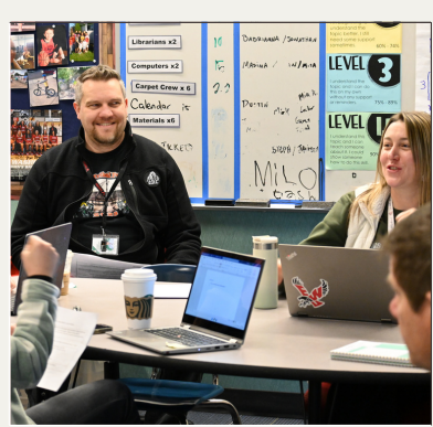
4th grade educators at Sunset Elementary engage in a powerful conversation about re-evaluating the rubric for measuring reading comprehension of informational text in their weekly PLC.