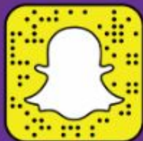
SNAPCHAT Press and hold down