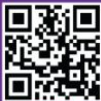
CAMERA Scan with your camera app

2. FILL OUT A SHORT REGISTRATION FORM TO GET YOUR BARCODE