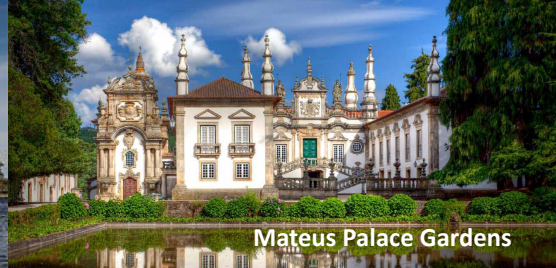
Mateus Palace Gardens