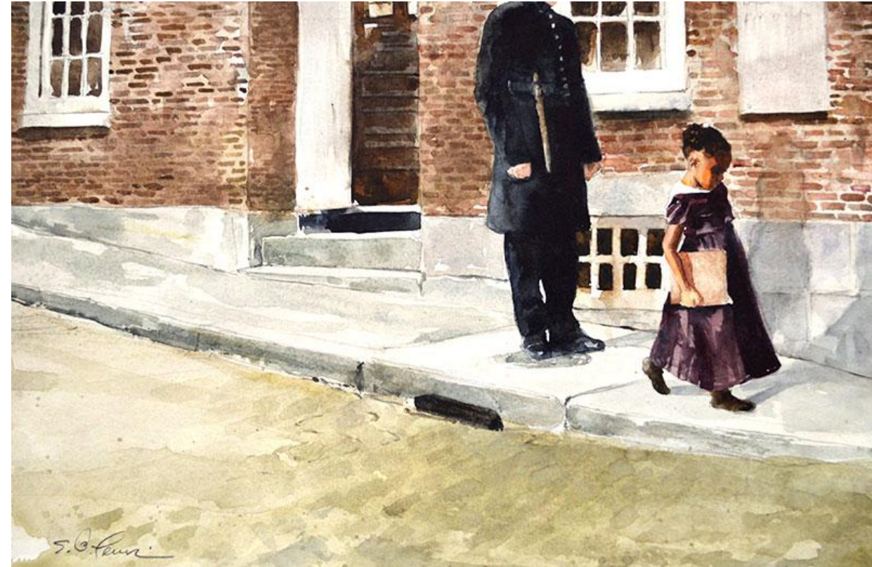
Artwork by E. B. Lewis from the picture book, The First Step: How One Girl Put Segregation on Trial

This name would also add to the small number of BPS schools named after women and African-American historical figures – and children.