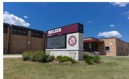
Melzer Elementary opened in 1959.

Instead, as is the case with many school districts, District 63 borrows funds in the form of bonds—purchased at the lowest possible interest rate—to complete this work. Over time, the bonds are repaid.