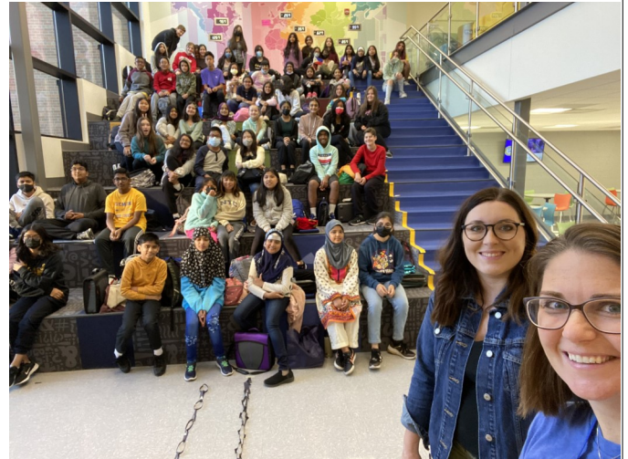
Middle school students gather on Gemini's Learning Stairs.

Tasked with keeping every facility in good shape is the District's 37-member Operations Department. On the frontline: our skilled building custodians. In addition to keeping classrooms, hallways, bathrooms, and lunchrooms spotless, custodians keep a sharp eye on the entire building—indoors and out—monitoring roofs, parking lots, playgrounds, mechanical systems, and more.