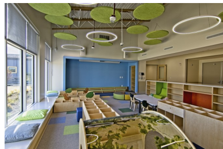
D63's Early Learning Center, opened in 2020, is custom designed for our youngest learners.

For example, Apollo opened its doors in 1970 as a junior high—not an elementary school. Some of its features are outdated or do not align with programming needs. For example, many classrooms lack natural light. Likewise, special education classrooms need more space than general education classrooms—and incorporate different features.