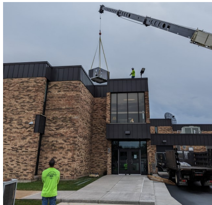
Installing a new AC unit at Apollo.

when scheduling capital improvements. Topping the list: expanding building capacity and ensuring that every school meets the specific requirements of the age group it serves.