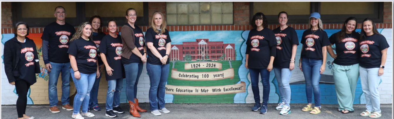
South Ocean Middle School PTA