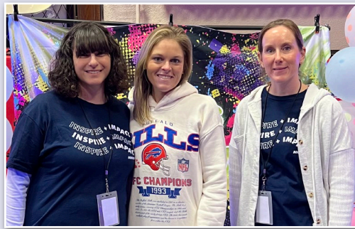
Medford Elementary PTA

The Patchogue-Medford School District proudly celebrates National Parental Involvement Day, recognizing the vital role parents and guardians play in the success of our students. Their active partnership, engagement, and dedication help foster an environment where students can thrive academically, socially, and emotionally. By working hand-in-hand with educators, families contribute to the ongoing achievements of our schools. This day serves as a reminder that the collective efforts of parents, guardians, and school staff are key to creating a supportive and collaborative community for our students. We deeply appreciate our families for their unwavering commitment and ongoing support.