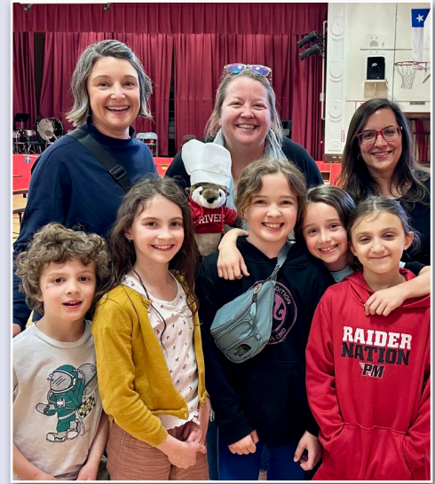
River Elementary PTA