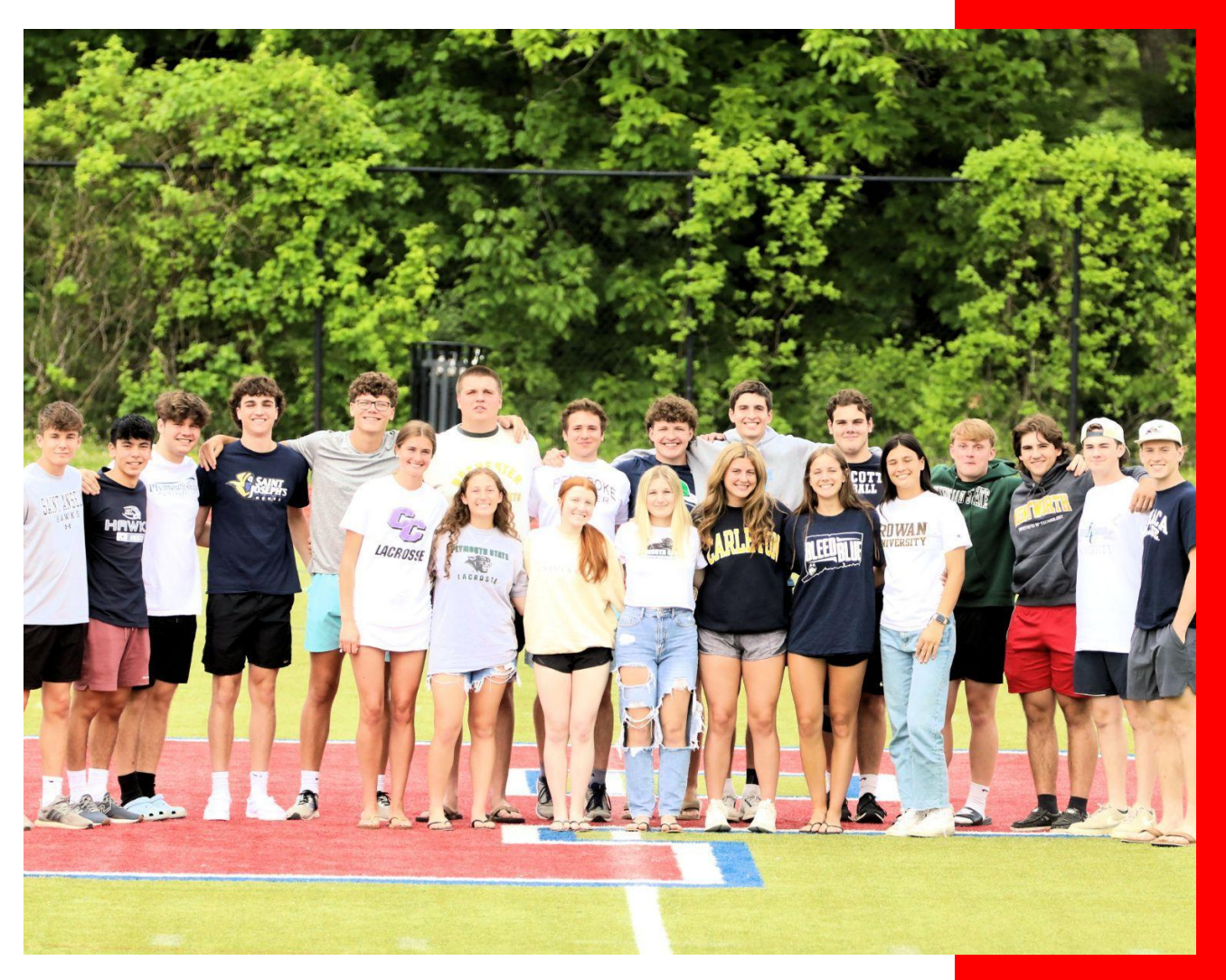
21 Student-Athletes committed to play college athletics.