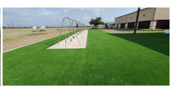
Wood River Elementary