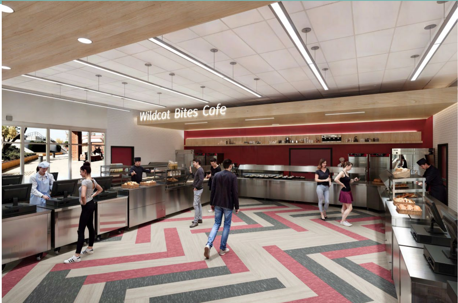
Changes And Progress Since Last Report - Blue