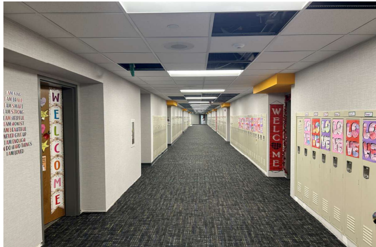
Unit B Hallway Renovations