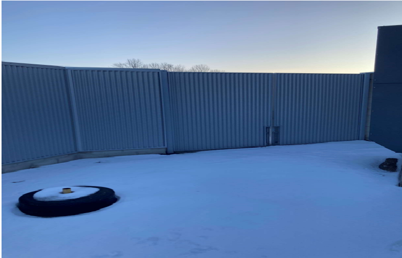
Mechanical Yard Sound Baffles