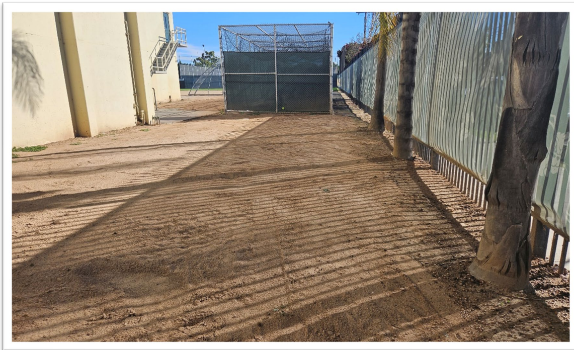
Photograph 6: Overview of exposed soils to the west of ball field along southern perimeter. View to the east.