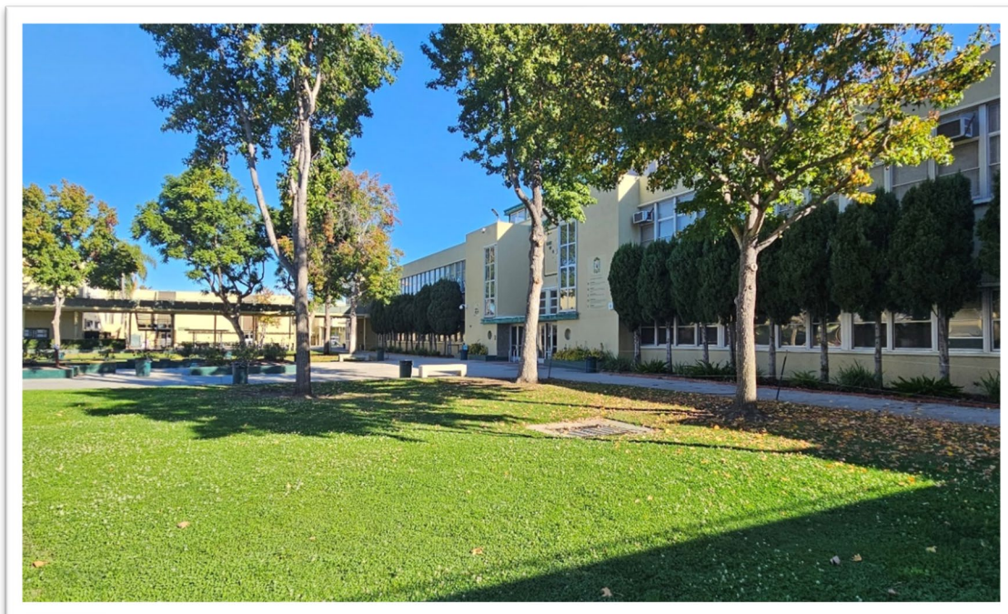
Photograph 4: Overview of Project site interior ground surface visibility and general landscaping. View to the north/northeast.