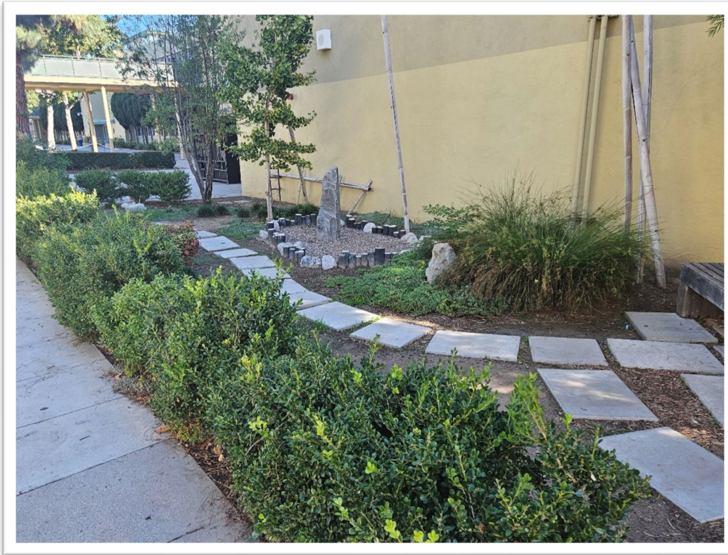
Photograph 3: Overview of Project site interior ground surface visibility and general landscaping. View to the northeast.