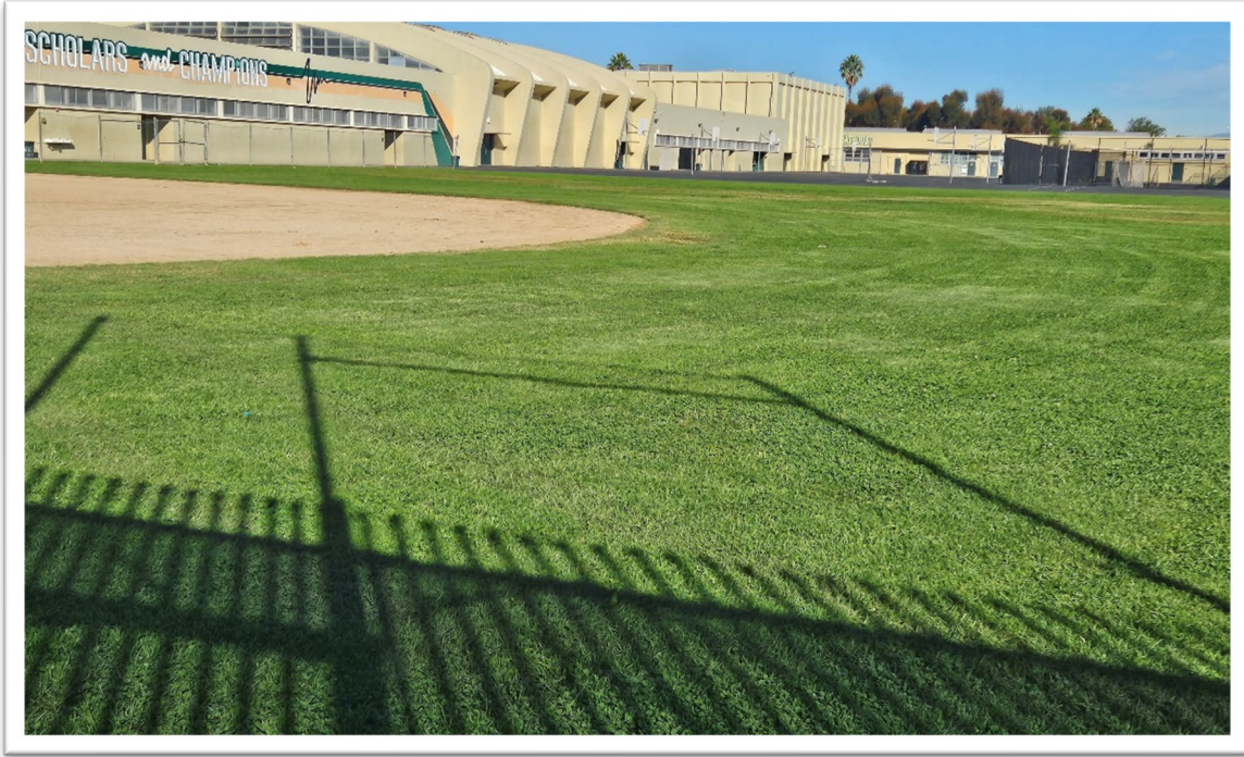
Photograph 1: Location of ball field on southern end of Polytechnic High School. View to north/northwest.