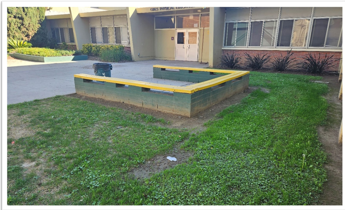
Photograph 5: Overview of Project site interior ground surface visibility and general landscaping. View to the east/northeast.