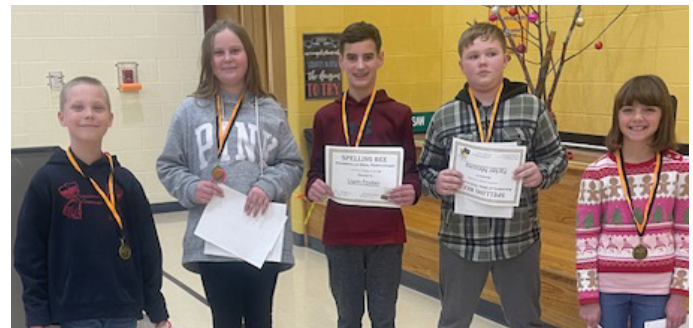
Adamsville Elementary Finalists