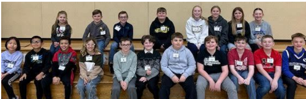
Nashport Elementary Finalists