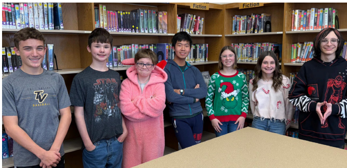
Middle School Finalists