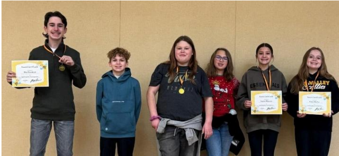
Dresden Elementary Finalists