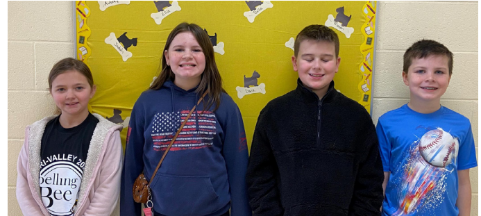
Frazeysburg Elementary Finalists