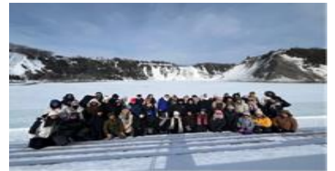
Photo: THS students in Canada '25