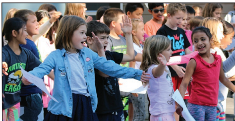
Students, staff and parents celebrated the opening of their new school during a ceremony in October 2017.