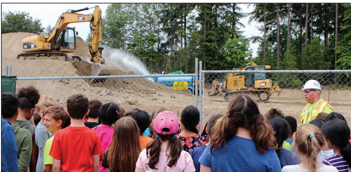
Students enjoy a demonstration of the construction equipment at Margaret Mead Elementary. The school opens in fall 2019. More photos: http://bit.ly/MeadElem