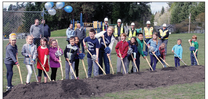
Students at Peter Kirk Elementary School celebrate the groundbreaking of their new school. More photos: http://bit.ly/PeterKirk