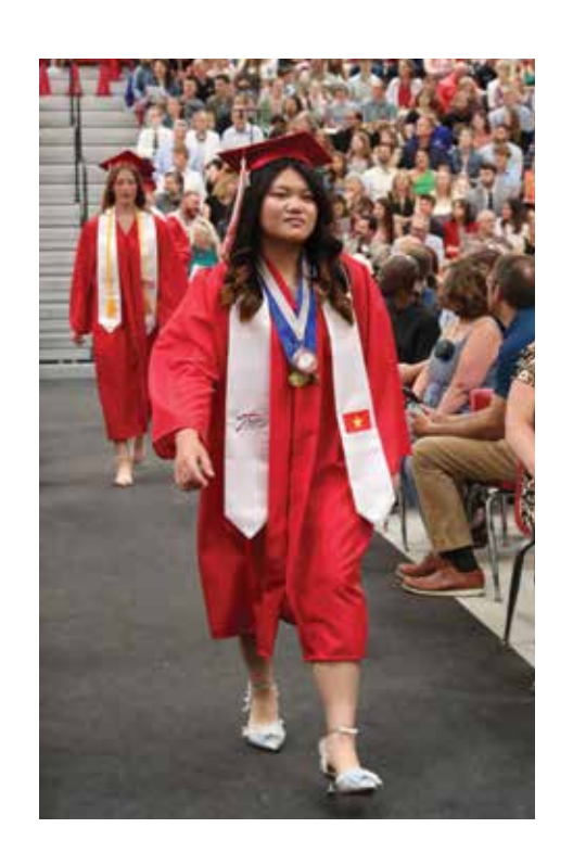
92% of graduates pursue post-secondary education.