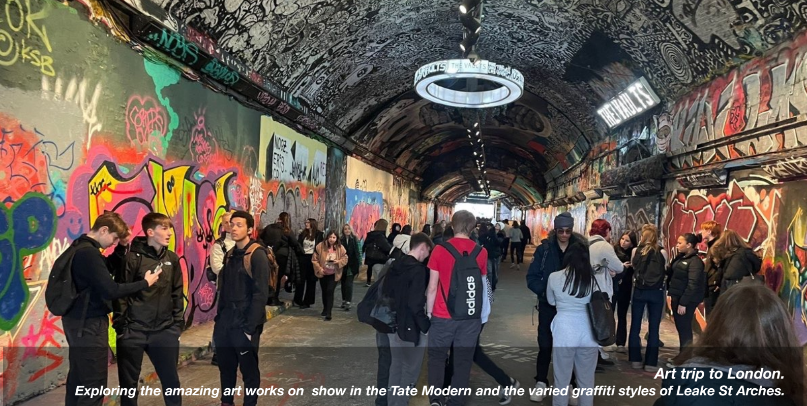
Art trip to London.

Exploring the amazing art works on show in the Tate Modern and the varied graffiti styles of Leake St Arches.