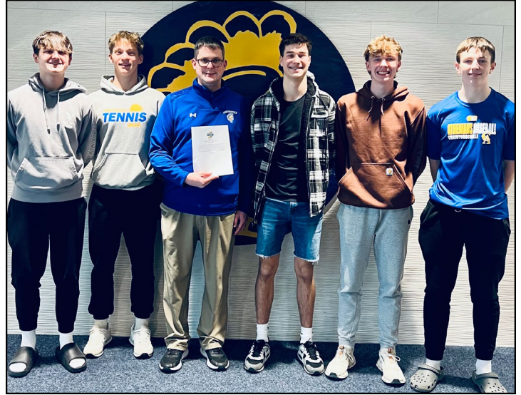
JV boys basketball team

IHSAA officials have recently noticed great sportsmanship and characteristics from our student athletes at various events and awarded them with the Exemplary Behavior award. Top photo is the JV boys' basketball team who was recognized for their politeness throughout the game and for continuing to play hard against a tough opponent even when the score wasn't in their favor.