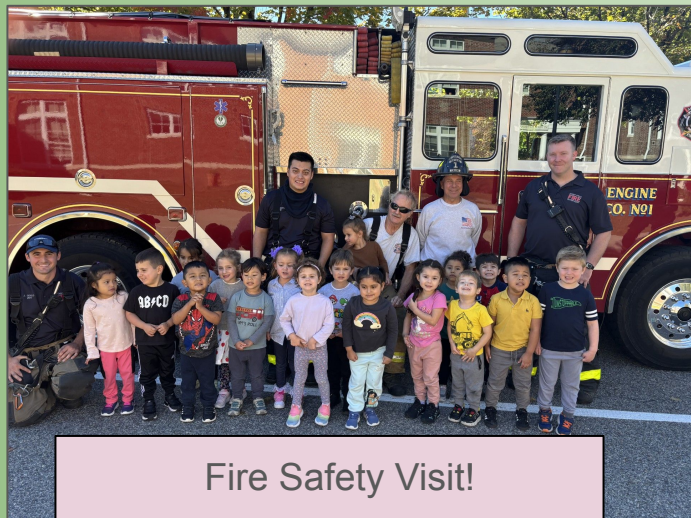
Fire Safety Visit!