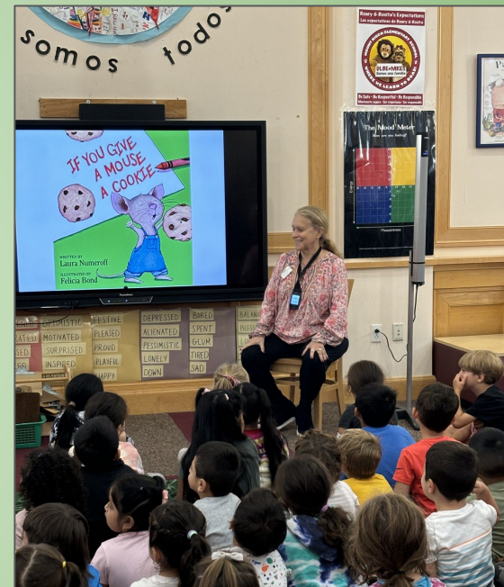
Author Visit: Laura Numeroff!