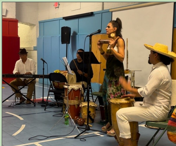
Musical Guests: Cumbia for Kids