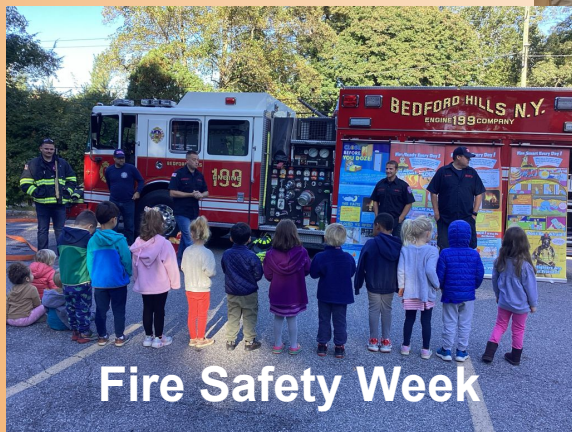
Fire Safety Week