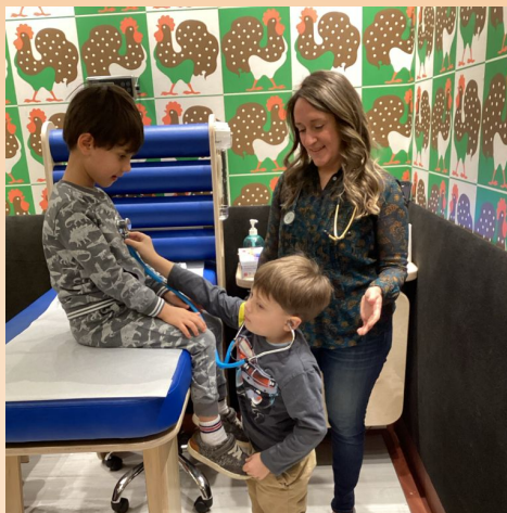
Visiting the Dr. Blunder