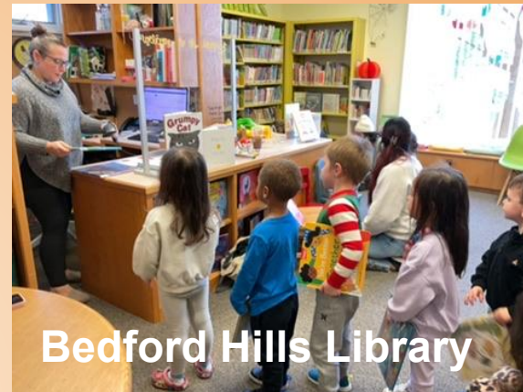
Bedford Hills Library