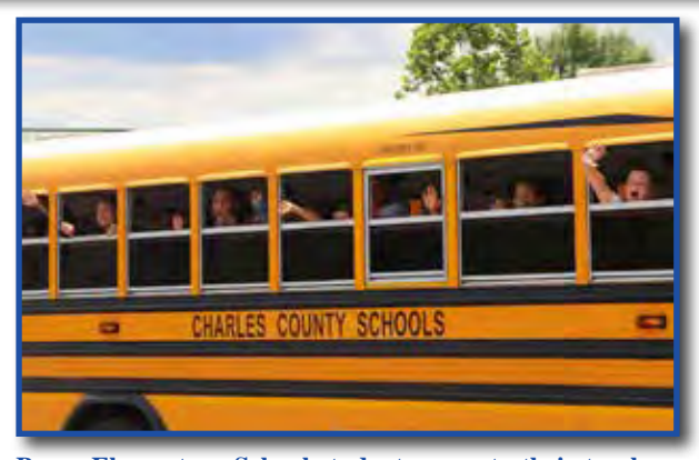
Berry Elementary School students wave to their teachers and friends on the last day of school as school bus drivers honk their horns as they leave the parking lot.

School Locator is an online system that allows the public to enter an address and see which three school zones — elementary, middle and high — an address is zoned for. The system also indicates if the address is eligible for bus service, what the bus number is and where the closest bus stop is located. School Locator can be accessed at www.ccboe.com under the Quick Links menu. The system uses mapping data from the county and filters it by school zones.